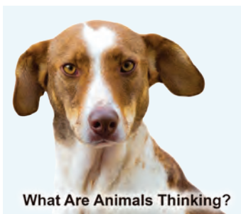
What Are Animals Thinking?

“Zooniverse” is home to the Internet’s largest, most popular and most successful citizen science projects. Its nearly 275,000 users collect data on well-defined research questions, from solar storm formation to tracking tropical cyclones and from seafloor exploration to characterizing whale sounds. Award # 1041419